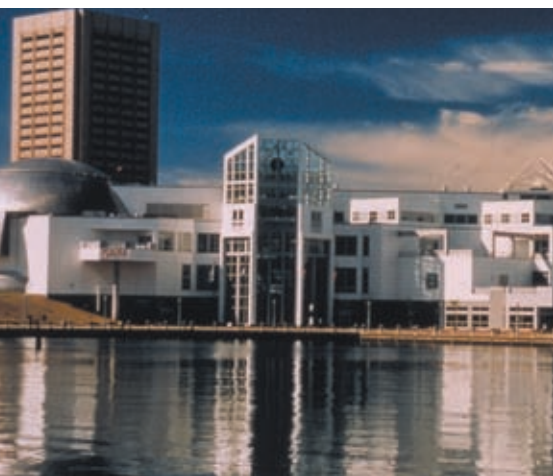
Great Lakes Science Center