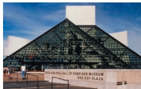
Rock and Roll Hall of Fame and Museum

Register online at www.ccfcm.org/spinereview10