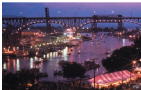
Flats entertainment center