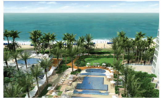
Ocean View from The Eden Roc

Call 1-800-319-5354 and reference Perioperative Medicine Summit 2009.