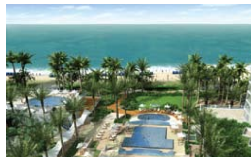
Ocean View from The Eden Roc

Visit www.cme.med.miami.edu for more detailed information and instruction.