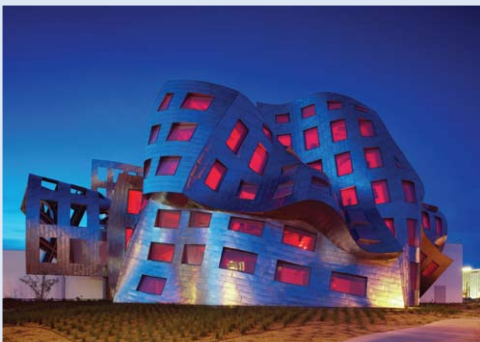
Cleveland Clinic Lou Ruvo Center for Brain Health – Las Vegas

Neurosurgeons, Interventional Neuroradiologists, Vascular Neurologists, Emergency Physicians, Critical Care Physicians and other healthcare professionals interested in the care of the stroke patient.